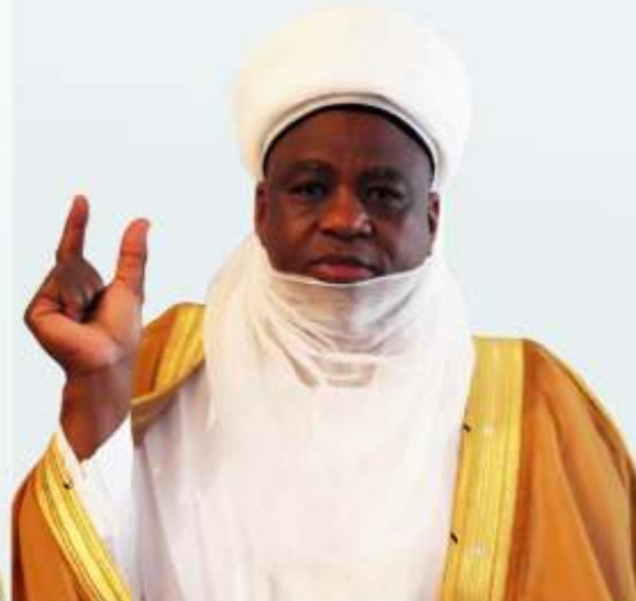
Amirul Mumineen Sultan Muhammadu Sa'ad Abubakar III Sultan of Sokoto

We Are This Close TO ENDING POLIO IN NIGERIA