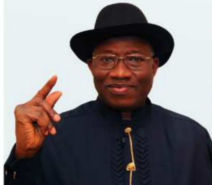
His Excellency, Goodluck Ebele Johnathan, GCFR President Federal Republic of Nigeria

We Are This Close TO ENDING POLIO IN NIGERIA