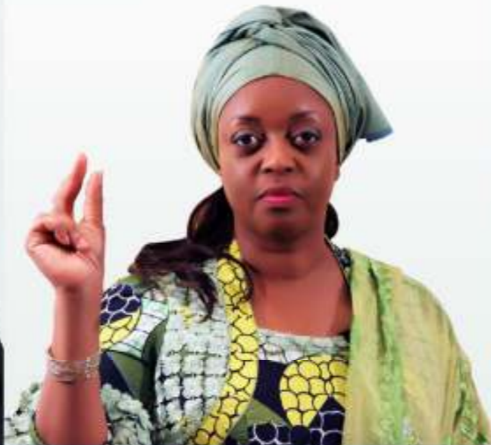
Diezani Alison-Madueke Hon. Minister of Petroleum Resources

We Are This Close TO ENDING POLIO IN NIGERIA