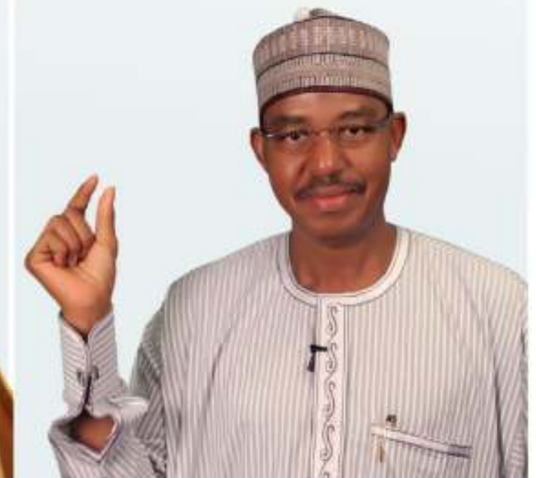
Dr. Khaliru Alhassan Hon. Minister of State for Health

We Are This Close TO ENDING POLIO IN NIGERIA