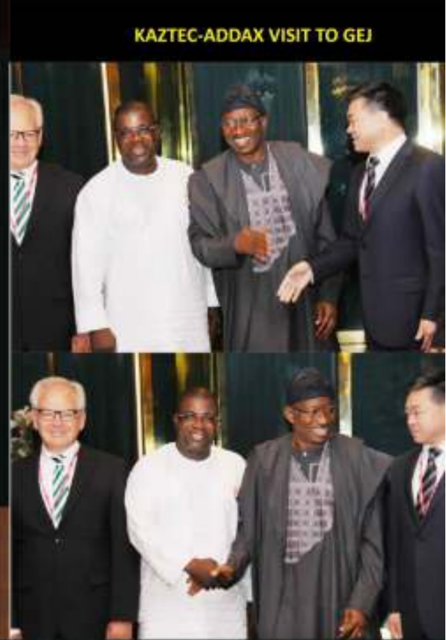
KAZTEC-ADDAX VISIT TO GEJ