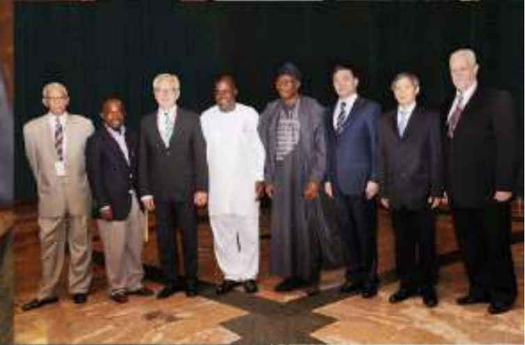
KAZTEC TEAM VISITS ADDAX PETROLEUM HQ GENEVA